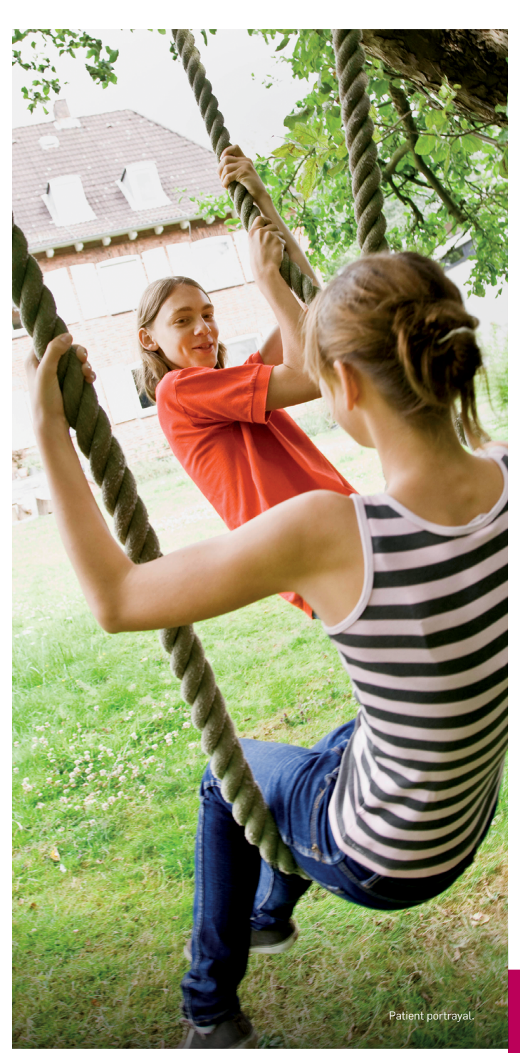
Please see additional Important Safety Information throughout brochure. Tap here for full Prescribing Information, including Medication Guide.

COSENTYX is sent to you from a specialty pharmacy because it's a biologic medication, which means it requires special handling and must be refrigerated. There are specific steps you'll have to take to arrange delivery. When you enroll in COSENTYX® Connect you'll have a dedicated COSENTYX® Connect Team Member to help guide you through every step of the process. Make sure you save the specialty pharmacy phone number since they'll need to call you to schedule delivery of your COSENTYX right to